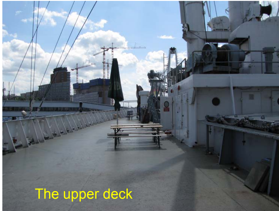
The upper deck