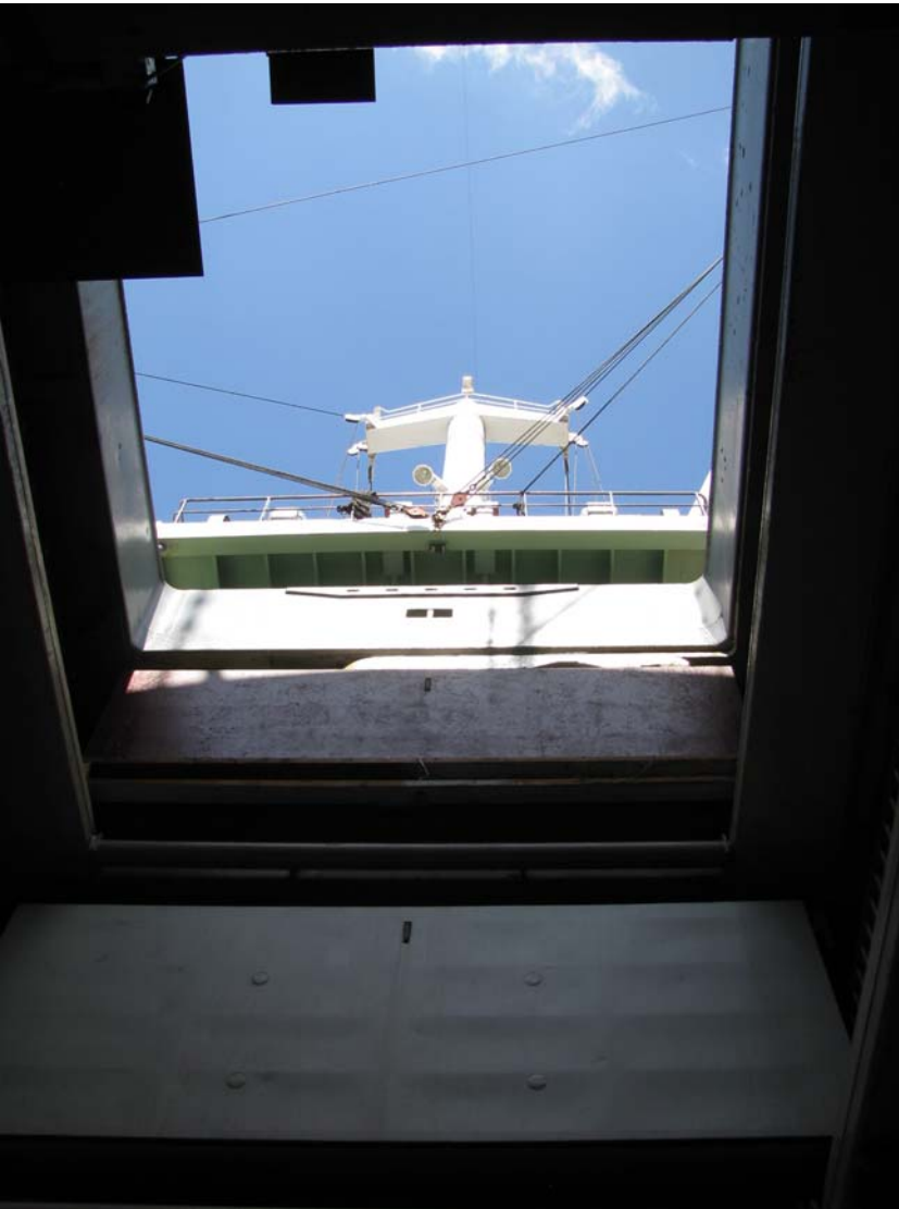
View from the stage to the sky